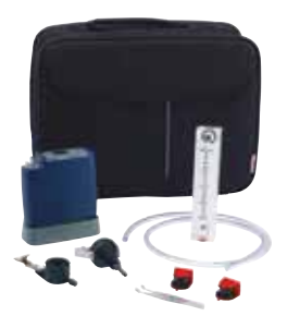
Starter Kit available to include sampling accessories