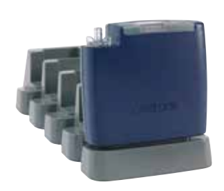
Apex2 pump with 5 way charger

Chargers: Single or 5-way Charge Time: Typically <6hrs